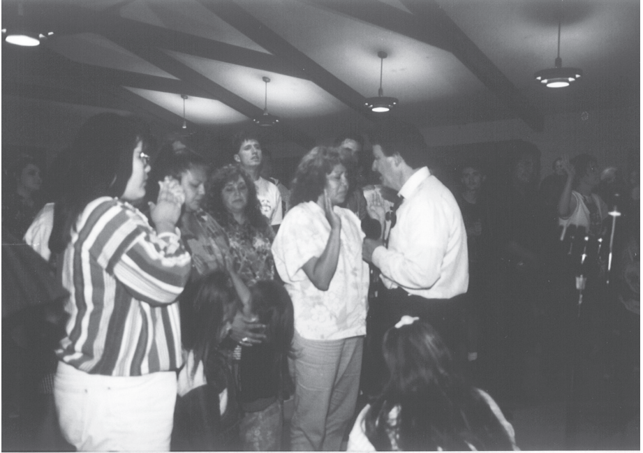
Warm Springs Indian Reservation